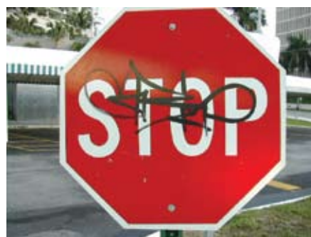
with security film